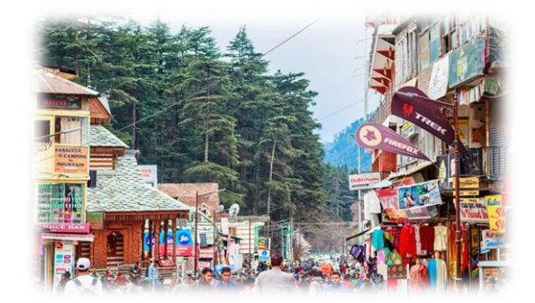
MANALI MALL ROAD 17 kms