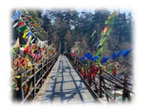
15 Mile Shaking bridge