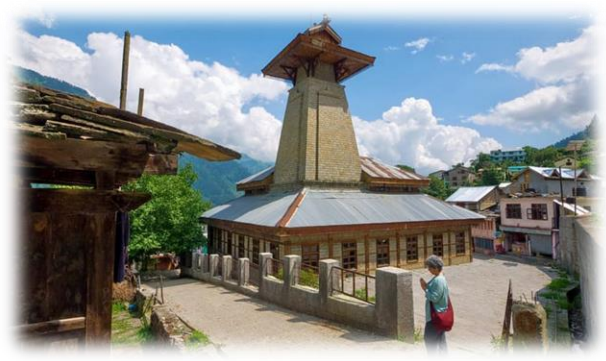
MANU TEMPLE - 19 Kms