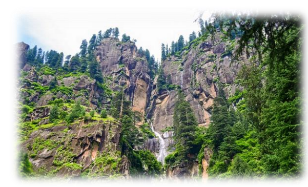
JOGINI FALLS - 20 Kms