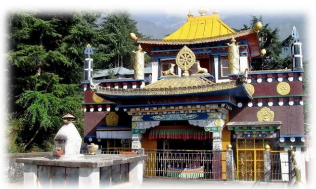
HIMALAYAN NYINGMAPA BUDDHIST TEMPLE - 15 Kms