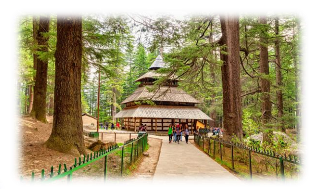
HADIMBA TEMPLE - 18 Kms