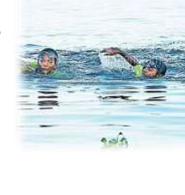
<u>SWIMMING</u>: The wide calm lake invites you to swim in its waters- very refreshing!

<u>CRUISES</u>: Cruises every evening are arranged in local boats to catch the glorious sunset and if you are lucky, you may even catch the moon rise. The evening sounds, sights and smells create a soothing experience.