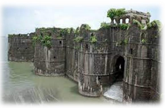
Korlai beach: (17 kms away)