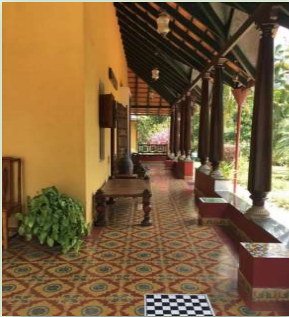
Play Board Games