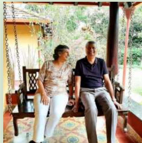
Enjoy the Swing